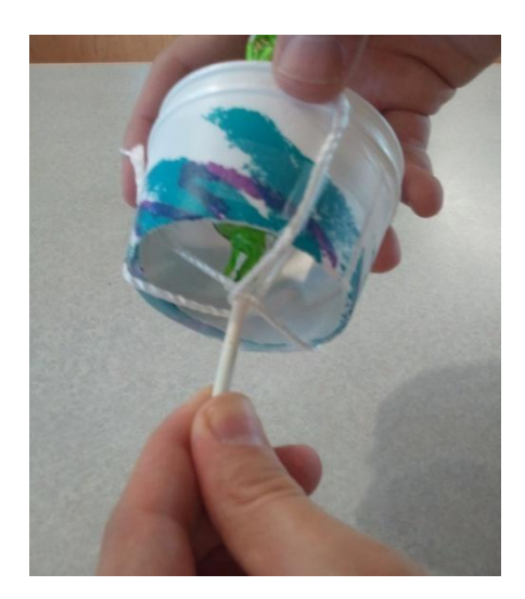
Figure 2. Closed snare made in activity.

Now compare the closed snares (strings) made in this activity with the way the closed snare looks on the real ISS robotic arm. See Figure 2 and 3 below.