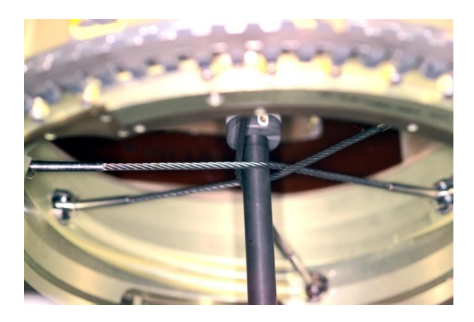
Figure 3. Closed snare on the robotic arm.