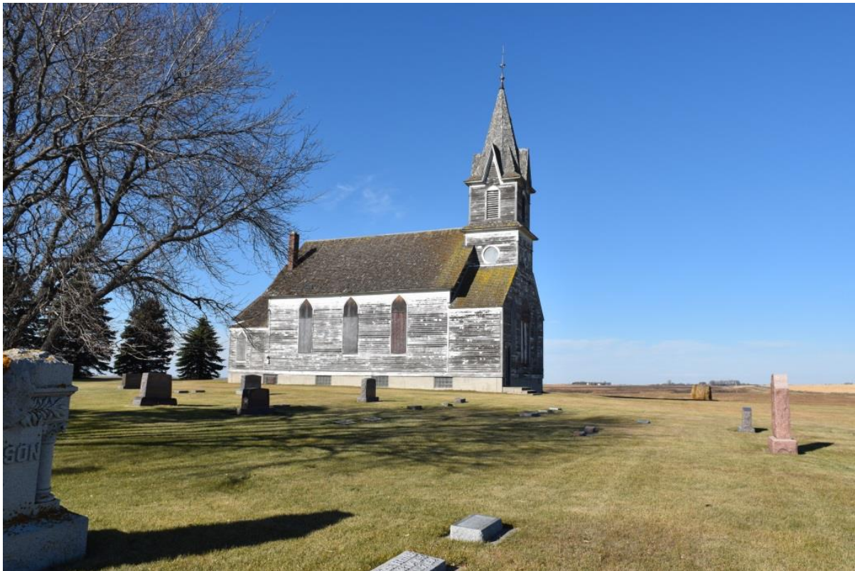
Norway Lutheran Church, Aneta, ND