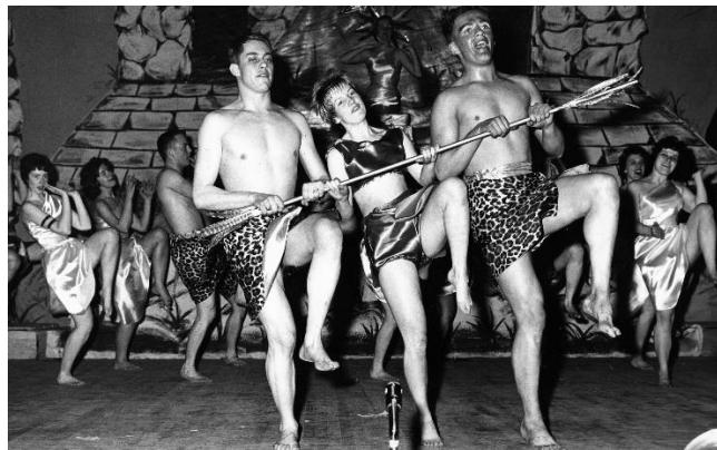
1961 Spring Follies

Comment: Jonathan Epstein, City University of New York