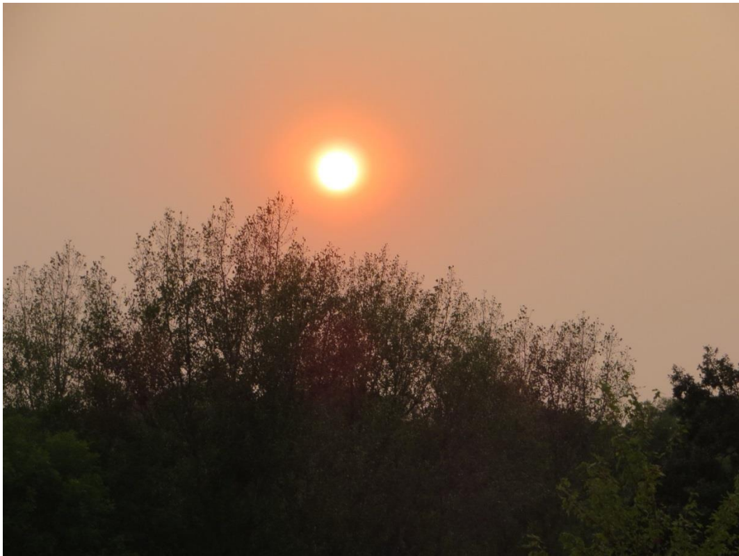
Fort Ransom State Historic Site; Courtesy Kim Porter