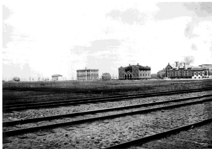
UND Campus, 1899