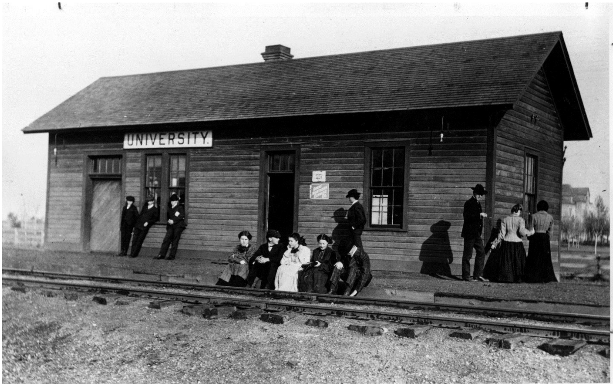
University Station

October 4-7, 2017 Ramada Inn Grand Forks, North Dakota