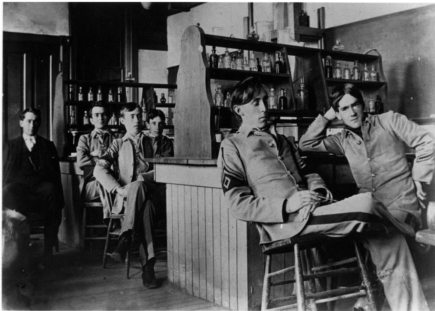
UND Classroom, c. 1890, Courtesy UND Special Collections